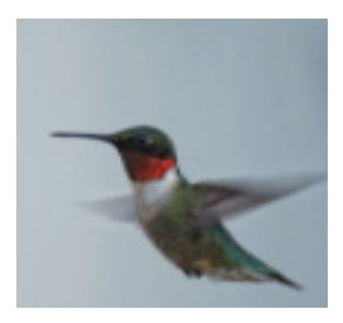
Ruby-throated Hummingbird Tiny, with green back and bright red throat (male). Female duller.

Black with red and yellow shoulder patches, which can be hidden (male). Female resembles sparrow.)