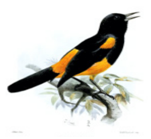
Baltimore Oriole Flame orange and black pattern with black head (male). Females dull greenish above, yellowish below. Melodic song. Weaves a hanging basket nest.

Brick red chest and gray back (male usually darker than female.) Common in yards/ gardens. Feeds on worms, insects, berries and fruit.