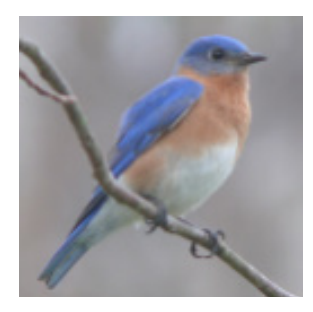
Eastern Bluebird Blue back, reddish chest, white belly. Female paler. Forest edge/ roadside habitat, nest boxes.

Small, with white back, striped face white spots on black wings, avery short bill. Male has red spot on back of head.