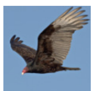
Very large, dark bird with red, featherless head. Six-foot wingspan. Soars with wings held in a "V". Eats carrion, often along the roadside.

Glossy blue-green above with bright white below. Glides in circles when flying. Often found nesting in Bluebird boxes.