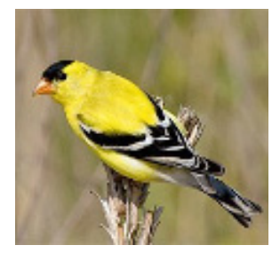
American Goldfinch Summer male bright yellow with black wings/tail/forehead. Summer female duller yellowgreen. Winter plumage yellowish brown/gray. Seed-eater common to woodland edges.